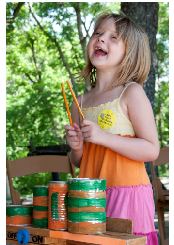
"Arty" Mobile Arts Van activity at the Smoky Hill River Festival